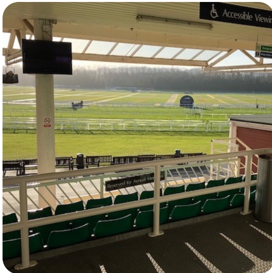
Berkshire 1st Floor Viewing Steps 3 Positions